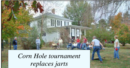
Corn Hole tournament replaces jarts